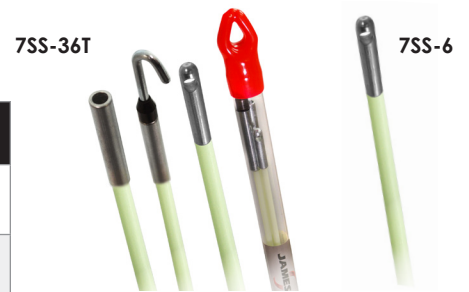
Permanently mounted bullet nose on each end.