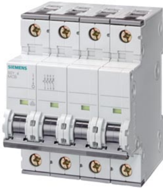
Miniature circuit breaker 400 V 10kA, 4-pole, A, 6A, D=70 mm