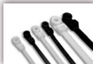
Mounting Hole Cable Ties