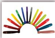
Color Cable Ties