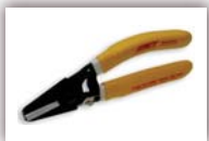
MG-1300 Removal Tool