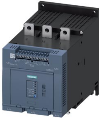
SIRIUS soft starter 200-600 V 370 A, 24 V AC/DC Screw terminals Thermistor input