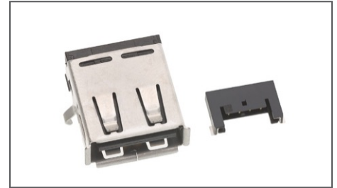
Left: Molex Standalone USB 2.0 Connector; Right: Pico-Lock USB 2.0 Connector Used in Molex USB Module