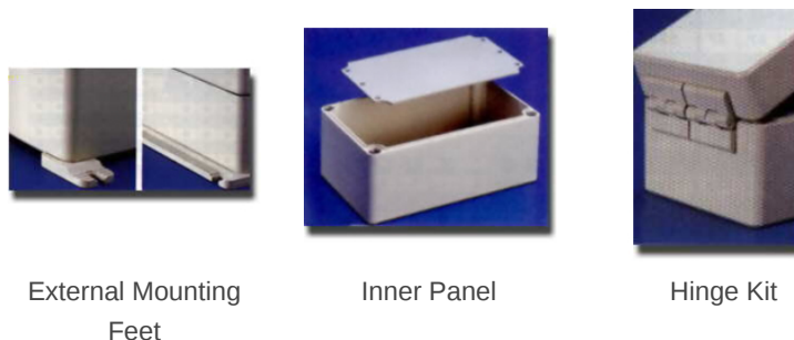
External Mounting Feet