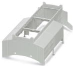
Installation component housing, width: 161.6 mm, color: light gray (7035)

Please be informed that the data shown in this PDF Document is generated from our Online Catalog. Please find the complete data in the user's documentation. Our General Terms of Use for Downloads are valid ( http://phoenixcontact.com/download )