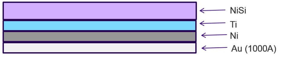
Figure 2: 150mm wafer back metal with Au