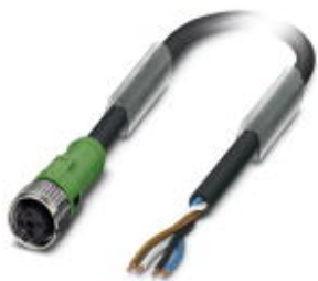
Sensor/actuator cable, 4-position, PUR, black-gray RAL 7021, free cable end, on Socket straight M12 SPEEDCON, A-coded, cable length: 10 m

Please be informed that the data shown in this PDF Document is generated from our Online Catalog. Please find the complete data in the user's documentation. Our General Terms of Use for Downloads are valid ( http://phoenixcontact.com/download )