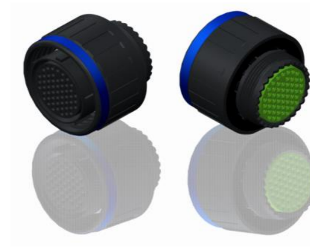
LAYOUT SHOWN AS EXAMPLE