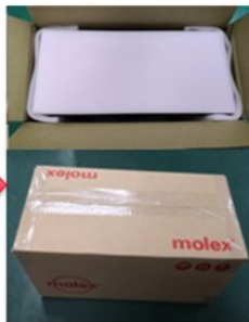
Single Box(with foam)