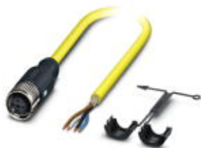
Sensor/actuator cable, 4-position, PVC, yellow, shielded, free cable end, on Socket straight M12 SPEEDCON, A-coded, cable length: 2 m

Please be informed that the data shown in this PDF Document is generated from our Online Catalog. Please find the complete data in the user's documentation. Our General Terms of Use for Downloads are valid ( http://phoenixcontact.com/download )