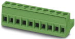
The figure shows a 10-pos. version of the product in green

PCB connector, nominal current: 12 A, number of positions: 2, pitch: 5 mm, connection method: Screw connection with tension sleeve, color: black, contact surface: Tin