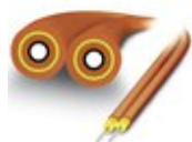
Fiber optic cable, multi-mode fiberglass 50/125 µm, OM2, length: various