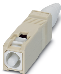
SC connector, with short bend protection (pigtail), for multi-mode 50/125 μm, beige

Please be informed that the data shown in this PDF Document is generated from our Online Catalog. Please find the complete data in the user's documentation. Our General Terms of Use for Downloads are valid ( http://phoenixcontact.com/download )