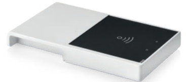
ID CPR30pro / ID CPR30pro SAM