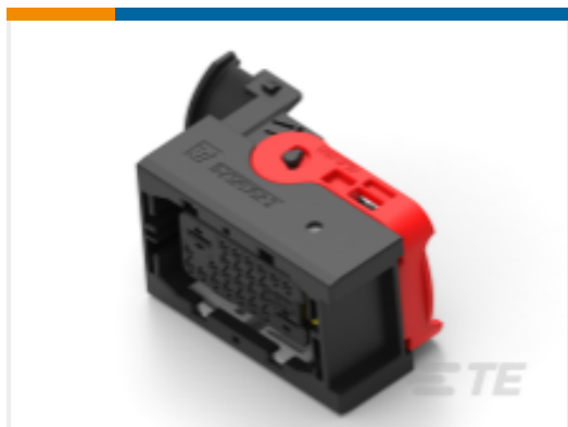
TE Part #1-2328352-2 25POS, MIXED,REC HSG,ASSY, SEALED, COD A