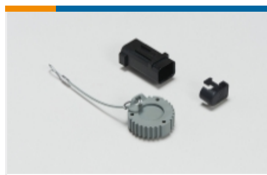
Automotive Connector Caps & Covers (2)