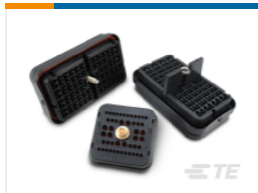
TE Part #DRB12-128PAE-L018 DEUTSCH DRB Housings