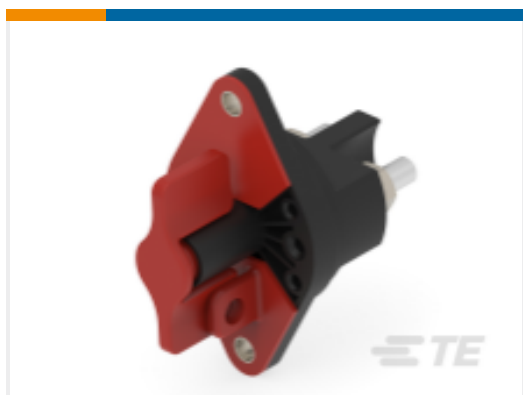
TE Part #K5000061 Batt. Disconnecter 35-314-131-R-901