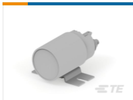
TE Part #K1011766 Relay 29-214-11