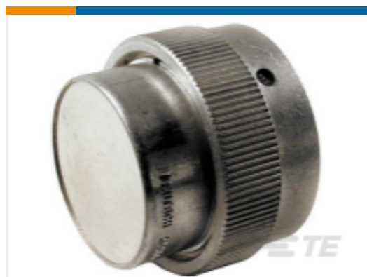
TE Part #HDC36-24-1E DUST CAP, 24SZ, REC, AL, NO LANYARD,HD30