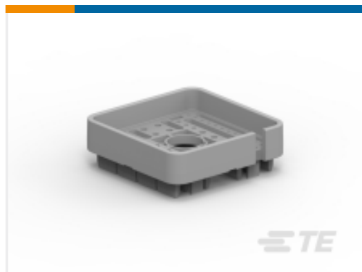
TE Part #WB-64PA DEUTSCH DRB Wedgelocks