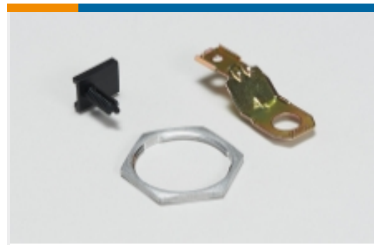
Other Automotive Connector Accessories(6)