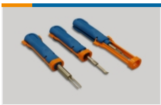
Insertion & Extraction Tools(1)