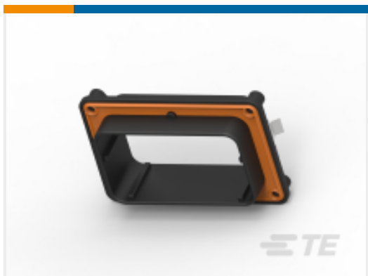
TE Part #DRBF-1A FLANGE, MOUNT, 102/128P, BLK, A