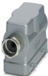
HEAVYCON B16 sleeve housing, for double locking latch, height: 76 mm, with 1 x Pg21 screw connection, lateral cable outlet

Please be informed that the data shown in this PDF Document is generated from our Online Catalog. Please find the complete data in the user's documentation. Our General Terms of Use for Downloads are valid ( http://phoenixcontact.com/download )