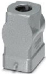
HEAVYCON B6 sleeve housing, for single locking latch, height: 72 mm, with 1 x M32 thread, straight cable outlet

Please be informed that the data shown in this PDF Document is generated from our Online Catalog. Please find the complete data in the user's documentation. Our General Terms of Use for Downloads are valid ( http://phoenixcontact.com/download )