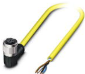
Sensor/actuator cable, 4-position, PVC, yellow, free cable end, on Socket angled M12 SPEEDCON, A-coded, cable length: 2 m

Please be informed that the data shown in this PDF Document is generated from our Online Catalog. Please find the complete data in the user's documentation. Our General Terms of Use for Downloads are valid ( http://phoenixcontact.com/download )