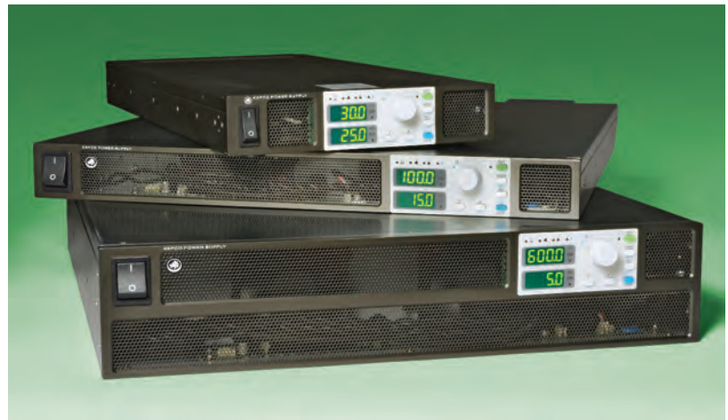
KLN Series Programmable Power Supply: 750W 1U, Half-Rack (top), 1500W 1U, Full Rack (middle), 3000W 2U, Full Rack (bottom)

Precise programming of voltage, current and their limits may be achieved from the front panel, or by analog means or by RS 485 digital control. GPIB or LAN interfaces are factory-installed options.