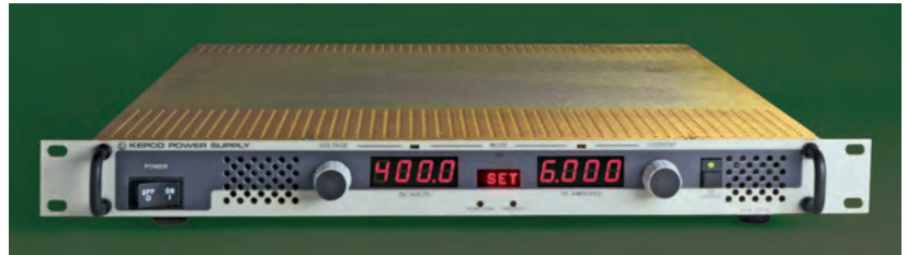
KLR MODEL TABLE