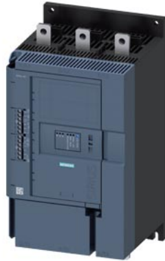
SIRIUS soft starter 200-600 V 250 A, 110-250 V AC Screw terminals Thermistor input