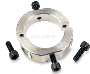
*Additional hardware NOT included