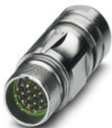
Coupling connector, straight, shielded: yes, for standard and SPEEDCON interlock, M23, No. of pos.: 16+2+PE, type of contact: Pin, Crimp connection, cable diameter range: 4 mm ... 6 mm

Please be informed that the data shown in this PDF Document is generated from our Online Catalog. Please find the complete data in the user's documentation. Our General Terms of Use for Downloads are valid ( http://phoenixcontact.com/download )