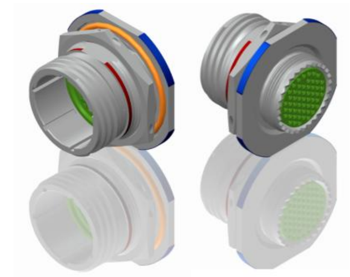
LAYOUT SHOWN AS EXAMPLE