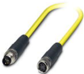
Sensor/actuator cable, 4-position, PVC, yellow, shielded, Plug straight M8, on Socket straight M8, cable length: 1.5 m

Please be informed that the data shown in this PDF Document is generated from our Online Catalog. Please find the complete data in the user's documentation. Our General Terms of Use for Downloads are valid ( http://phoenixcontact.com/download )