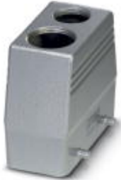
HEAVYCON B16 sleeve housing, for double locking latch, height: 76 mm, with 1 x M32/1 x M25 thread, straight cable outlet

Please be informed that the data shown in this PDF Document is generated from our Online Catalog. Please find the complete data in the user's documentation. Our General Terms of Use for Downloads are valid ( http://download.phoenixcontact.com )