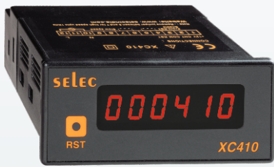
36 x 72mm