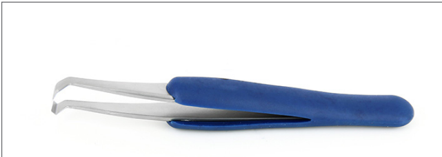
14AGW.C.DR Tips: cutting, predominantly angled blades. OAL: 115mm