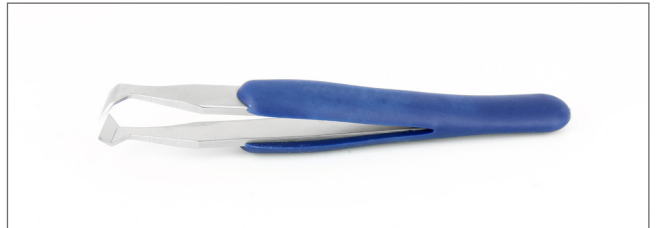
15A.C.DR Tips: cutting, angled blades. OAL: 120mm