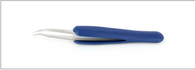
5C.SA.DR Tips: curved, bent, ultra fine. OAL: 115mm