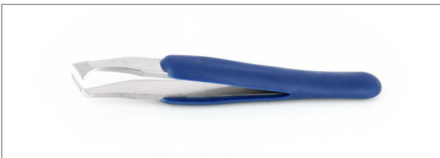
15AGW.C.DR Tips: cutting, predominantly angled blades. OAL: 115mm