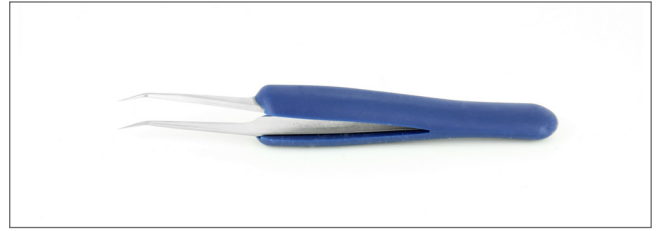
51S.SA.DR Tips: bent, extra fine. OAL: 115mm