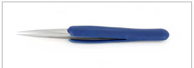
AA.SA.DR Tips: sharp, fine. OAL: 130mm