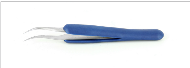
7.SA.DR Tips: very fine, curved. OAL: 120mm