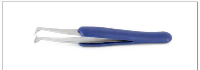
14A.C.DR Tips: cutting, predominantly angled blades. OAL: 115mm