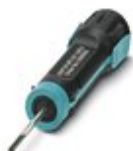
Assembly tool, for CK 1.6... crimp contacts for small conductor cross sections

Assembly tool - UNIFOX MT-CK 1.6/2.5 - 1089092