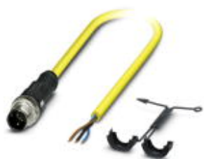
Sensor/actuator cable, 3-position, PVC, yellow, Plug straight M12 SPEEDCON, A-coded, on free cable end, cable length: 2 m

Please be informed that the data shown in this PDF Document is generated from our Online Catalog. Please find the complete data in the user's documentation. Our General Terms of Use for Downloads are valid ( http://phoenixcontact.com/download )