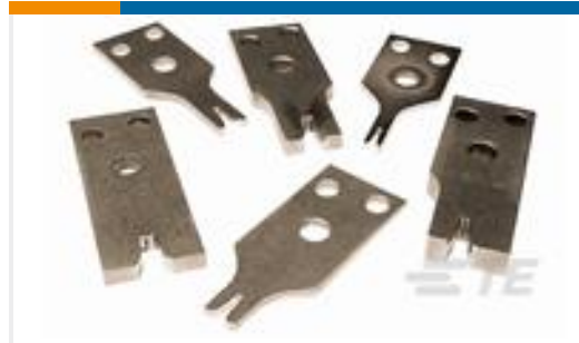
TE Part #2-456135-9 CRIMPER, INSULATION "O"(.210")