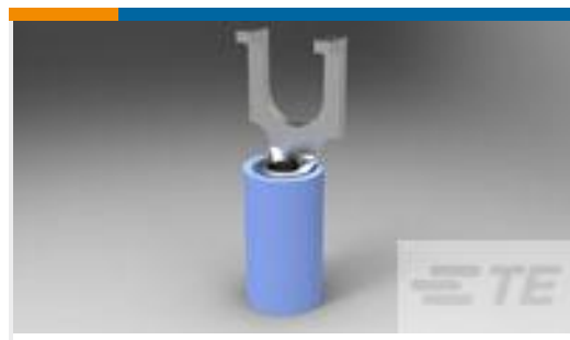
TE Part #2-320863-2 TERMINAL,PIDG SPD FLG 16-14 10