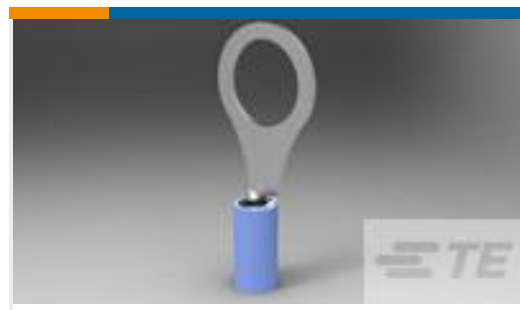
TE Part #2-320575-1 TERMINAL,PIDG R 16-14 5/16