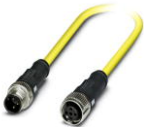
Sensor/actuator cable, 3-position, PVC, yellow, Plug straight M12 SPEEDCON, A-coded, on Socket straight M12 SPEEDCON, A-coded, cable length: 20 m

Please be informed that the data shown in this PDF Document is generated from our Online Catalog. Please find the complete data in the user's documentation. Our General Terms of Use for Downloads are valid ( http://phoenixcontact.com/download )