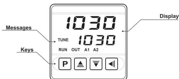
Fig. 02 - Identification of the parts referring to the front panel

The controller's front panel, with its parts, can be seen in the Fig. 02: