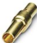
Crimp contact, turned, Single contact, contact diameter: 1 mm, crimp range: 0.08 mm 2 ... 0.22 mm 2