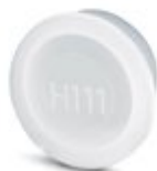
Plastic protection cap for connectors with M23 knurled nut