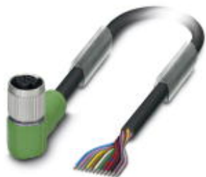
Sensor/actuator cable, 12-position, PVC, black RAL 9005, free cable end, on Socket angled M12 SPEEDCON, A-coded, cable length: 1.5 m

Please be informed that the data shown in this PDF Document is generated from our Online Catalog. Please find the complete data in the user's documentation. Our General Terms of Use for Downloads are valid ( http://phoenixcontact.com/download )