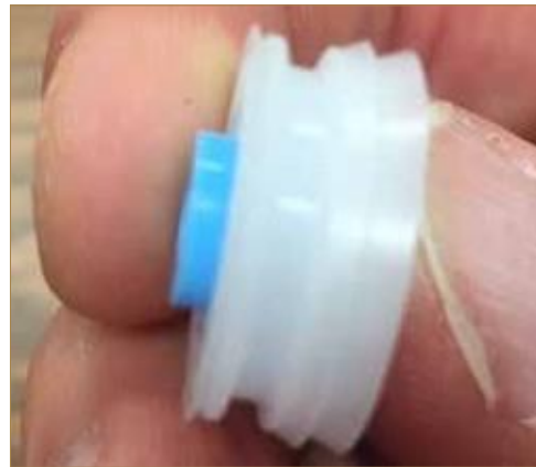
BETTER CHEMICAL COMPATIBILITY