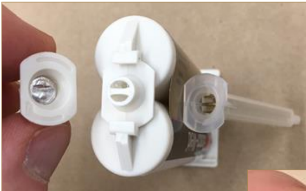
CURRENT CARTRIDGE CAP

The new cap is keyed and cannot be installed backwards, so partially consumed cartridges can be saved and used later.