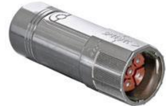
Contact Arrangement mating view

B ST A 082 NN 00 58 0100 000 B S A 082 N 00 58 0100 000