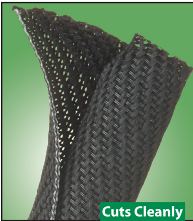
Cuts Cleanly Hot Knife

Colors Available: Black w/White Tracer (TB)