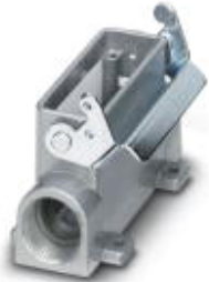
HEAVYCON box mounting base D25, with single locking latch, height 57 mm, with supports 2xM25

Please be informed that the data shown in this PDF Document is generated from our Online Catalog. Please find the complete data in the user's documentation. Our General Terms of Use for Downloads are valid ( http://phoenixcontact.com/download )