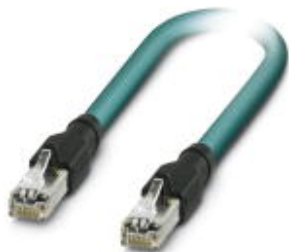
Patch cable, CAT5e, 4-pair, shielded, line, assembled at both ends with straight RJ45/IP20 heads, length: 5 m

Please be informed that the data shown in this PDF Document is generated from our Online Catalog. Please find the complete data in the user's documentation. Our General Terms of Use for Downloads are valid ( http://download.phoenixcontact.com )