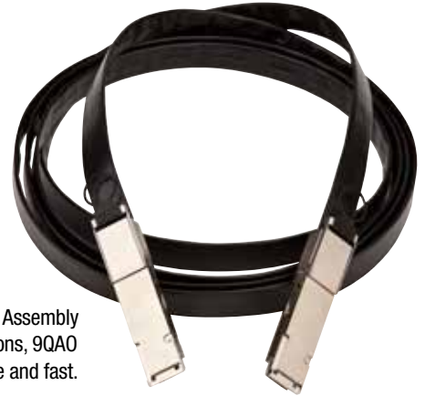
3M Twin Axial Cable Assembly for QSFP+ Applications, 9QA0 Series - flat, foldable and fast.

Nor-Tech's design was accepted by the client. In fact, the client's reps told the system integrator personnel that their proposal was the only one that came close to what they had in mind. The 3M Twin Axial Cable Assembly helped achieve that winning design.