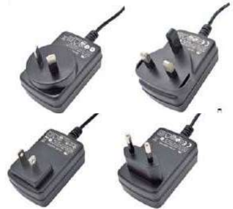
*Product images are for illustrative purposes only and may vary from actual design.