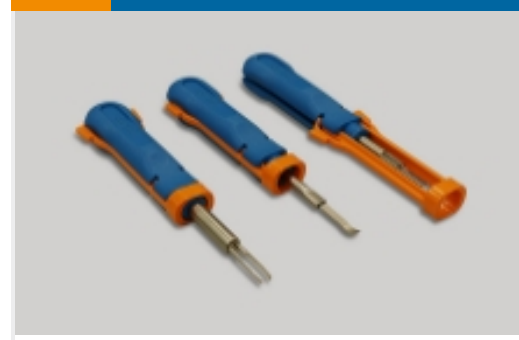
Insertion & Extraction Tools(11)