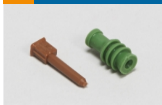
Automotive Seals & Cavity Plugs(11)