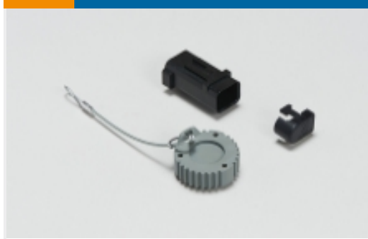
Automotive Connector Caps & Covers (20)