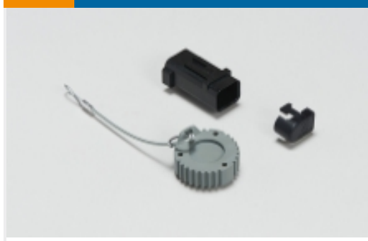
Automotive Connector Caps & Covers (65)