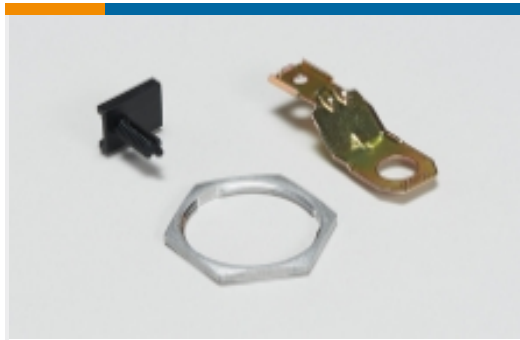
Other Automotive Connector Accessories(11)