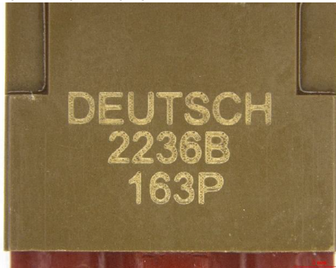
LASER MARKING AFTER TESTING