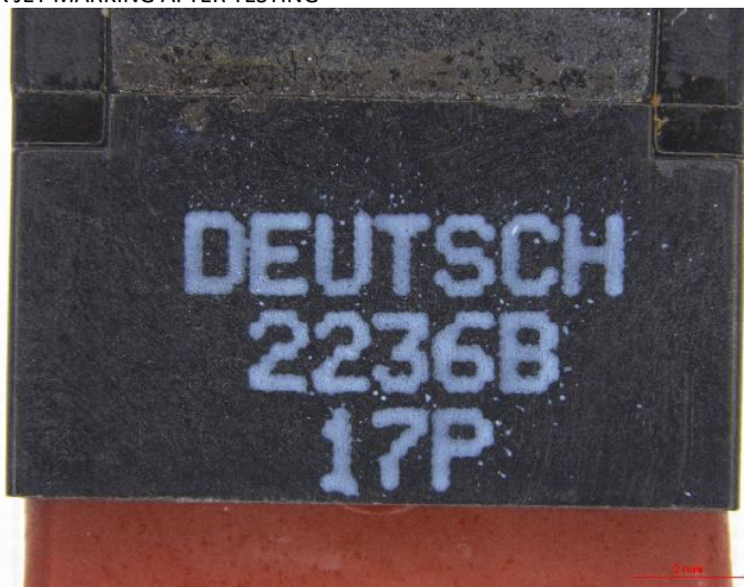
INK JET MARKING AFTER TESTING