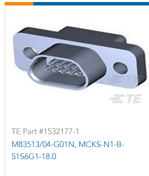
TE Part #1532177-1 M83513/04-G01N, MCKS-N1-B- 51S6G1-18.0