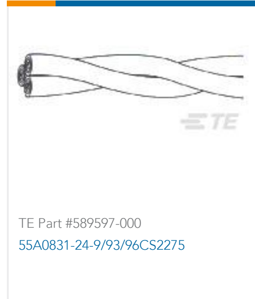
TE Part #589597-000 55A0831-24-9/93/96CS2275