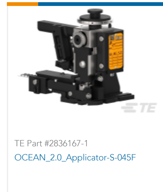
TE Part #2836167-1 OCEAN_2.0_Applicator-S-045F