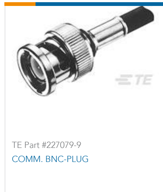
TE Part #227079-9 COMM. BNC-PLUG