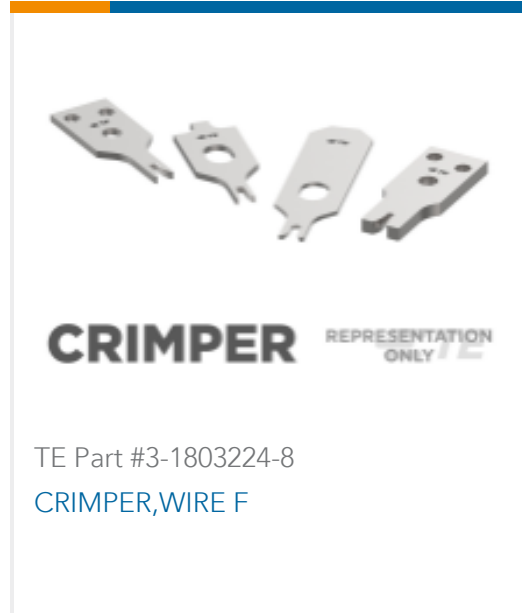
TE Part #3-1803224-8 CRIMPER, WIRE F