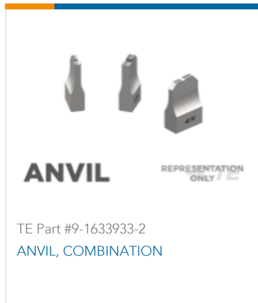
TE Part #9-1633933-2 ANVIL, COMBINATION