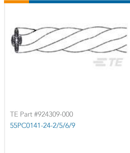
TE Part #924309-000 55PC0141-24-2/5/6/9