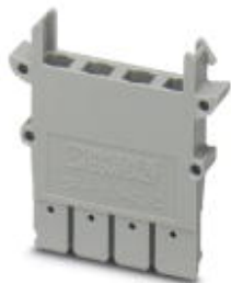
Connector housing, length: 31.6 mm, width: 5.2 mm, height: 31.7 mm, number of positions: 1, color: gray

Please be informed that the data shown in this PDF Document is generated from our Online Catalog. Please find the complete data in the user's documentation. Our General Terms of Use for Downloads are valid ( http://phoenixcontact.com/download )