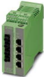
Ethernet Lean Managed Switch with four 10/100 Mbps RJ45 ports and two 100 Mbps FX-ST multi-mode ports

Please be informed that the data shown in this PDF Document is generated from our Online Catalog. Please find the complete data in the user's documentation. Our General Terms of Use for Downloads are valid ( http://phoenixcontact.com/download )