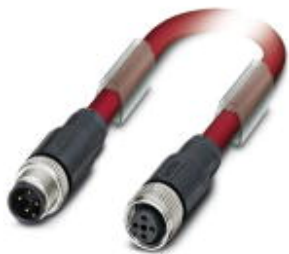
Bus system cable, CC link (10 Mbps), 4-position, PVC, red, shielded, Plug straight M12, A-coded, on Socket straight M12, A-coded, cable length: 10 m

Please be informed that the data shown in this PDF Document is generated from our Online Catalog. Please find the complete data in the user's documentation. Our General Terms of Use for Downloads are valid ( http://phoenixcontact.com/download )