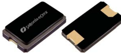
8.0 x 4.5mm Ceramic SMD