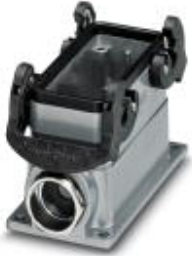
Box mounting base, with double locking latch, height 67 mm, with screw connection, 2x Pg21

Please be informed that the data shown in this PDF Document is generated from our Online Catalog. Please find the complete data in the user's documentation. Our General Terms of Use for Downloads are valid ( http://phoenixcontact.com/download )